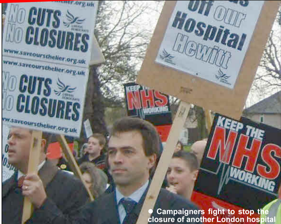
● Campaigners fight to stop the closure of another London hospital

"As London Mayor I will fight to get the best health services for every Londoner."