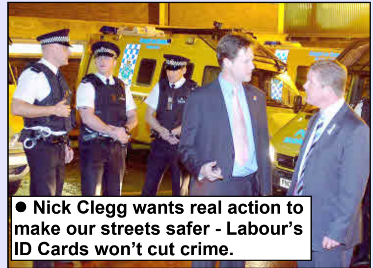
● Nick Clegg wants real action to make our streets safer - Labour's ID Cards won't cut crime.

New Liberal Democrat Leader Nick Clegg is calling on Labour to drop their ID card plans.