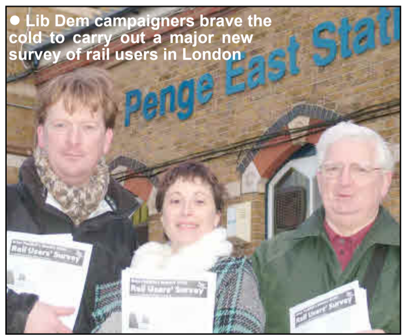
● Lib Dem campaigners brave the cold to carry out a major new survey of rail users in London

Brian Paddick has launched a London wide rail survey to give rail users their chance to have their say on what needs to be done to improve the system.