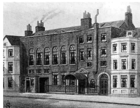
Willis's Rooms in St James – the site of the foundation of the Liberal Party 150 years ago.

On 6 June 1859, at Willis's Rooms in King Street, St James, London, three groups of MPs – Radicals, Whigs and Peelites – met to formalise their parliamentary coalition to oust the Conservative government of Lord Derby and bring in a new administration under Lord Palmerston. Thus was born the first Liberal government, and the meeting in Willis's Rooms marks the foundation of the Liberal Party.